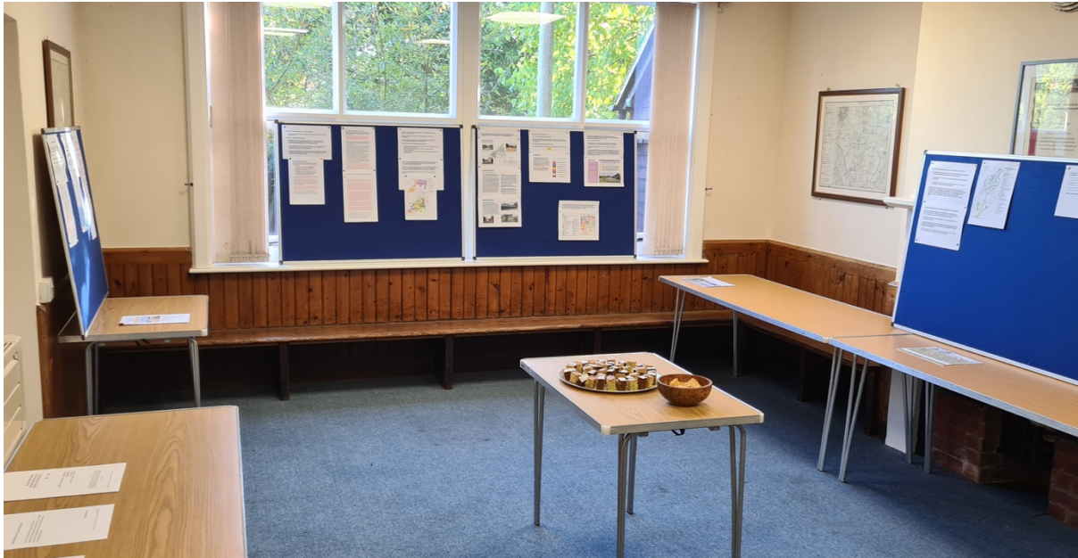
Image taken of the 9 October 2022 public consultation in the Clubroom at the Portal Hall.

The consultation period will end at 5 p.m. on 18 Nov.